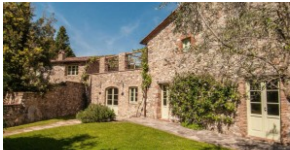
This magnificent Villa in the

Tuscan coast is set in beautiful countryside, in an exceptionally panoramic position among olive groves, in the hills between Lucca and the Versilia coast.