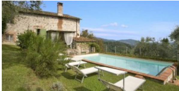
This charming Villa in Lucca

for 6 people with pool nestles peacefully in the hills between Lucca and the Versilian coast.