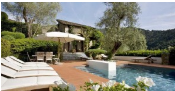
Villa in the Tuscan seaside

with pool, situated in a small hamlet in a very picturesque hillside setting near Camaiore reachable along a 2 km unpaved road.