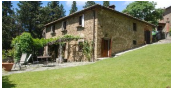
This Tuscany villa is located

in a quiet and secluded position. This small, rural hamlet with its fortified walls dating from Medieval times, is one of the best remaining examples of its kind in Tuscany. It is located, just north of Radda in Chianti, in a beautiful position overlooking vineyards and olive groves.