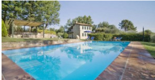
Villa in Lucca set in the

open countryside on the outskirts of the town, this attractive stone built farmhouse, surrounded by lawns and beautiful gardens, is ideally positioned for you to enjoy privacy and tranquility within easy reach of the town centre, shops, restaurants and pavement cafes, and the wonderful sandy beaches of Versilia.