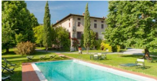
This fantastic Villa in Lucca

dates from the 16th century. The property has been completely restored without detracting from the original character of the house, the ancient cotto floors, beamed ceilings and old fireplaces have all been preserved.