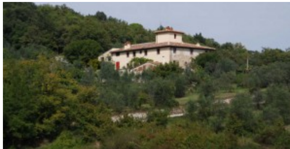
This huge Villa in Florence,

located in a very panoramic position overlooking the hills of Florence and a small lake, consists of 3 parts, the oldest of which was built in the 13th century and was used afterwards by the pilgrims who stopped there to rest.