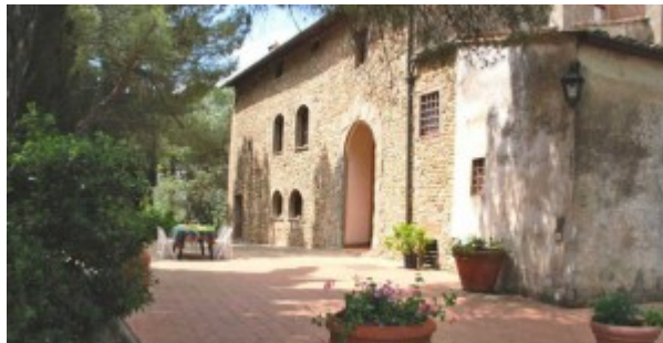
This beautiful villa in

Florence is situated in the countryside, just 15 kilometres from the town center. It is an original stone Florentine villa, built on the ruins of an ancient medieval tower. Most of the very spacious rooms have vaulted ceilings.