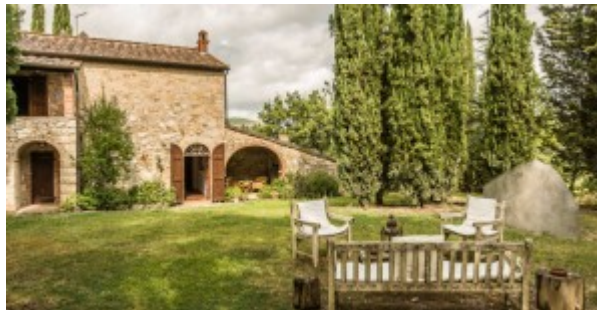
This particular and

fascinating Villa in Chianti is located in the heart of Chianti, a region renowned worldwide for its wine production.