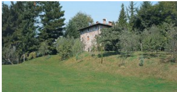
Villa in Versilia for 9/10

people with pool located in a very peaceful position in the hills between Lucca and the Versilian coast, only one km from a small medieval village.