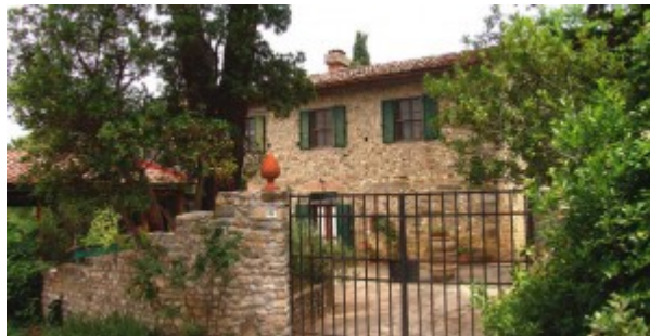
Typical Tuscany villa stone-

built, located on an estate producing Chianti wine.