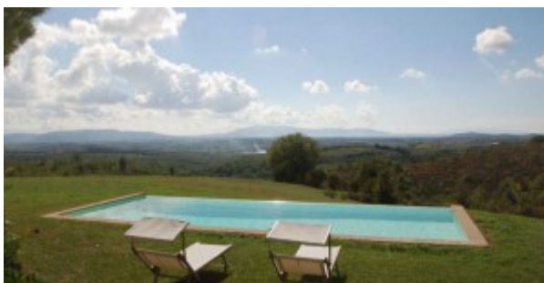
Set on a hillside in a typical

Maremma landscape, this Tuscany villa is the perfect shelter from the city life. The location is one of the most fascinating of Tuscany for the unspoiled nature, the beautiful sea with extended wild beaches, the Etruscan villages and the wine and gastronomic culture. The property is therefore an ideal choice for those looking for