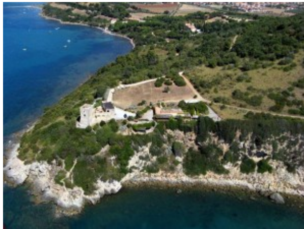
The exquisite medieval

Tower is located in Grosseto, south of Tuscany. This completely private estate offers a delightful holiday ambiance and counts as one of the most beautiful and fascinating locations on the Tuscan coast.