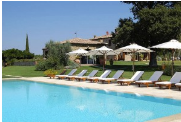
Between Pienza and

Montepulciano, in one of the most fascinating areas around Siena, it is a villa of extraordinary elegance. Reached by following the lane leading to this Luxury villa in Pienza you are at once attracted by the light and space, by the fragrance and smells of the wood surrounding the property. The villa, overlooking the towns of Pienza and Montefollonico is very discrete as if not wanting to disturb the natural proportions. Inside it is cosy and refined, every room different to the other with fireplaces and spacious areas for relaxing. Extremely well furnished.