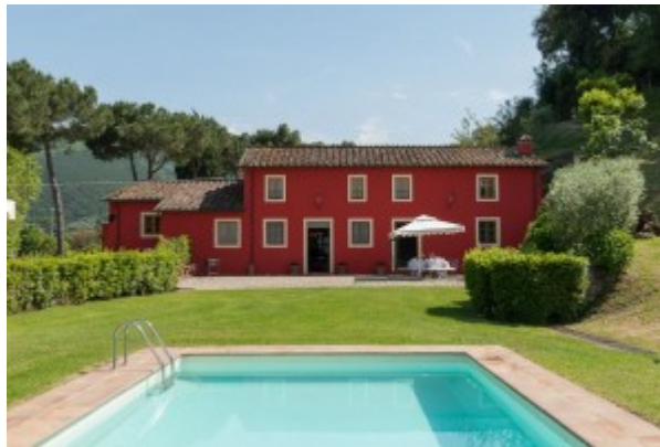
Ancient oil mill where the

inhabitants of the village used to bring their harvest of olives of the year for the pressing, now is a Luxury villa in Lucca. Surrounded by wonderful natural terraces enriched with olive groves and lonely cypresses, it has a magnificent view on the medieval city of Lucca. Notwithstanding the restoration, the residence maintained its rural features, but the distinguishing characteristics are a sober and ancient elegance. Excellently furnished.