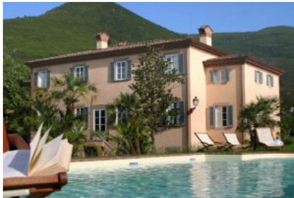
A beautiful driveway flanked

on either side by a row of cypresses leads to this fantastic mid-17th Century traditional Luxury villa in Lucca.