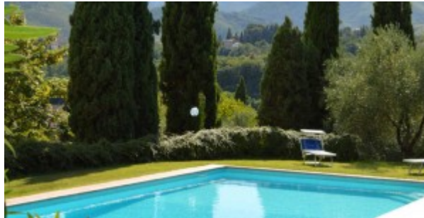
Set in the hills South-East

of Lucca, this Lucca villa is an ideal retreat for family summer vacations.