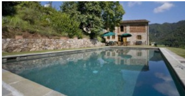
This lovely Lucca villa

provides a wonderful setting, nestling in the countryside and the hills between Lucca and the Versilian coast. From here you will be able to make beautiful visits to the beaches and excursions into the mountains and the little surrounding villages.