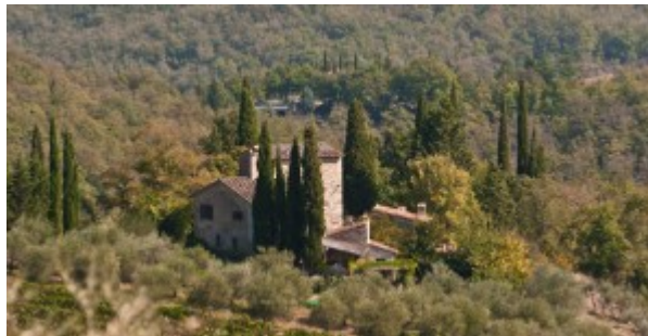
This beautiful Chianti Villa is

located in a very quiet and secluded position situated in Chianti. The owners of the estate, with long experience in providing guest accommodations, completed restoration of this stone-built farmhouse in 2005. Their aim was to make it the ideal residence for those seeking a totally relaxing holiday in Chianti, so they have provided full-time staff to take care of the house and to prepare meals for guests.